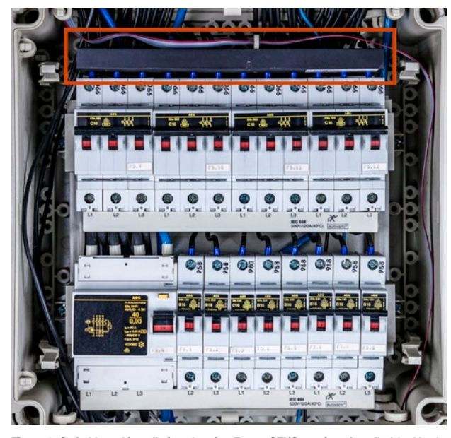
Figure 1: Switchboard installation showing EnergySENS monitors installed (red box)

Measuring energy consumption, power, reactive power, power factor, voltage and current for various machines and process systems in a manufacturing environment or building management system is obviously a very necessary function. Integration of measured data with process control protocols, and algorithms appropriate to condition monitoring