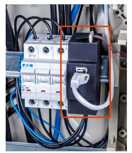
Figure 3 Three-sensor arrangement suitable for the monitoring of an induction motor

three wires and 12 wires. These can be individual single-phase circuits, or three-phase circuits. In total 120 circuits can be monitored per individual communications module. The basic layout of the analysis scheme is shown