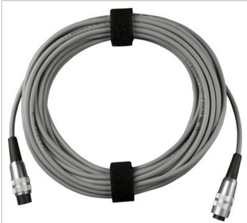
Extension cable for Referenz-Sensor (Z360F)