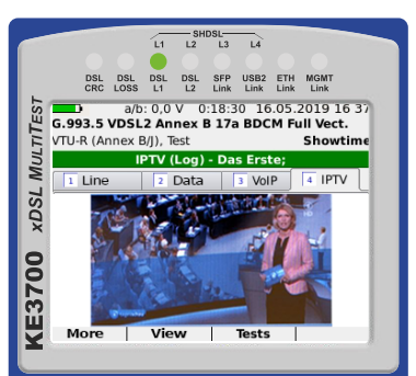
IPTV function test with preview image