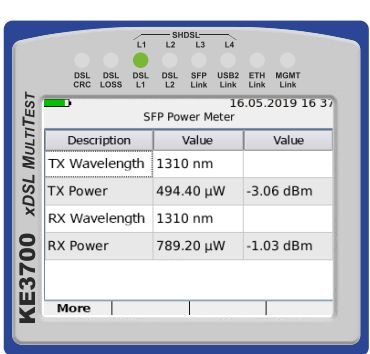
Fibre optics power meter