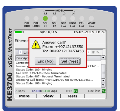
Incoming VoIP call